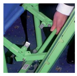
2. Undo spring clips on the track, close and lock.