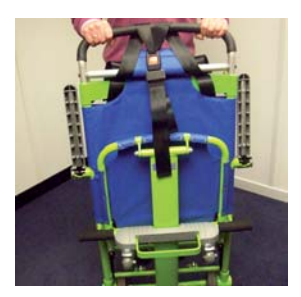
2. Remove the protective cover and place the chair on the ground in a suitable position.