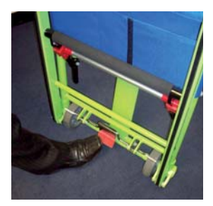
14. Ensure the brake mechanism is locked.