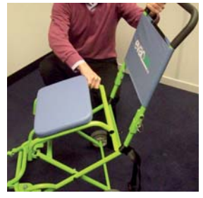
4. Hold the handle and locate the seat bar into the bracket on the rear frame.