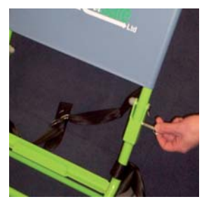
3. Remove the safety pins on each side of the handle and fold the handle down.