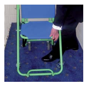
4. Holding on to the top of the chair pull down on the seat. Once the chair is open bring over the two arms. <u>ATTENTION</u> Please be aware that the arms are NOT WEIGHT BEARING and should be folded back prior to the user/client on exiting the chair.