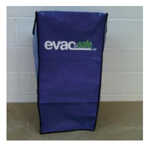
1. Remove chair from storage location and place on the ground in a suitable position.