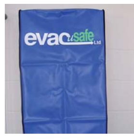
1. The chair should be located near to the exit it serves. It should be hung on the hooks provided or can be leant against a wall.