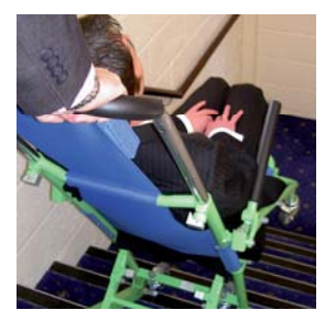
10. Hands are now placed on top of the handle, tilt the chair back and manoeuvre over the edge of the stairs.