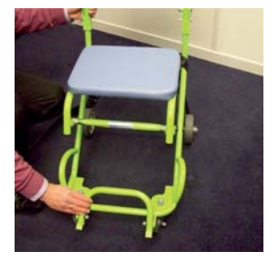
1. Fold foot rest back to closed position.