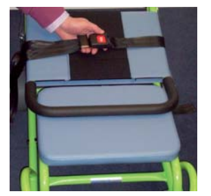
2. Undo the safety belt.