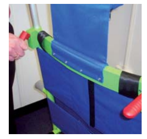
When in position, open the two red spring clips. This will allow the handle to be raised. Once raised, close the two red spring clips and ensure they have re-engaged, this will lock the handle in place.