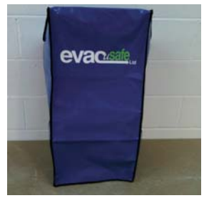
6. Return to storage position.