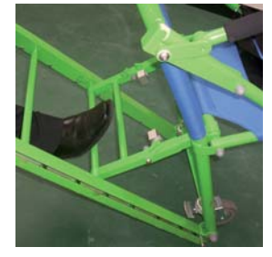
9. Once the chair is at the stairwell, any bumps, strips or stair protectors can be traversed by putting your foot on the bar as shown.