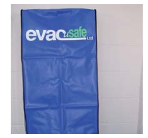
6. Place chair back in storage area and replace protective cover.