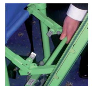
Pull the track back and pull the crossbar towards/upwards to you and close the spring clips. Ensure they have re-engaged by pushing down on the track unit.