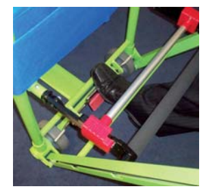
TO OPERATE THE CHAIR

7. Once the client is in the chair release the brake mechanism by placing your foot on top of the red footpad and push down.