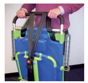
17. Pass the lower part of the support harness through the foot rest and connect to upper harness. Place chair back into storage location and replace protective cover.