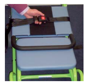
5. Fasten the safety belt around the folded chair.