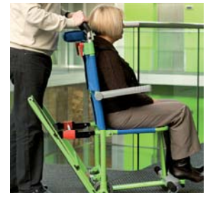
8. Make your way to the emergency exit with your hands in the pushing position on the handle.

7. Once the client is in the chair release the brake mechanism by placing your foot on top of the red footpad and push down.