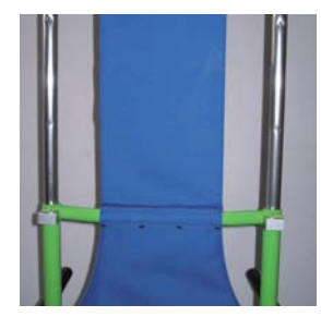
6. Close the spring clips and ensure they have re-engaged, this will lock the handle in place.