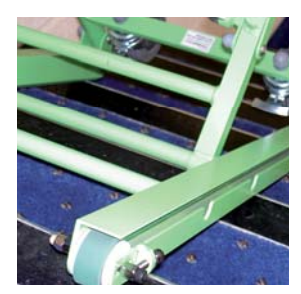
11. Keeping the tracks firmly in contact with the stairs, ensure a firm grip, apply downwards pressure on the handle and allow the chair to operate downwards.