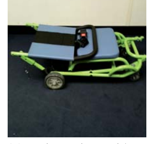
4. Lower down to the ground, into a folded position.