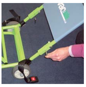
3. Unfold the handle and insert the safety pins on each side to secure.