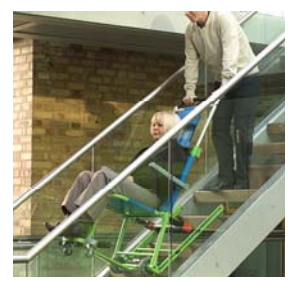
12. To make the chair descend, push the handle down towards your feet, this will ensure a smooth controlled descent.