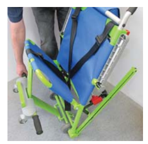
4. Release the support strap, open the chair from the side to a seating position, using the black handle and then ensure that it is locked into place, by pushing down on the bar with the two red locks.