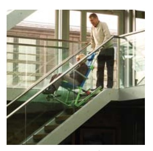
11. Manoeuvre the chair forward onto the top two steps, make sure the tracks stay in full contact with the stairs.