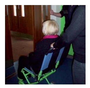
10. When you get to ground floor manoeuvre to final exit.