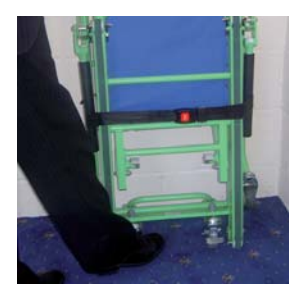
1. Ensure the footbrake is locked.