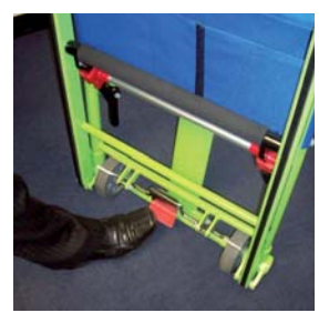
3. Engage the brake mechanism by pressing down on the red footpad shown in the picture.