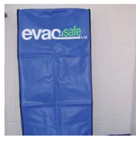
1. The chair should be sited near to the exit it serves. It should be hung on the hooks provided or can be leant against a wall.