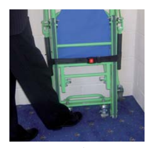
Remove the chair from the wall and place on the ground. Engage the footbrakes by pressing down on the foot pedals on BOTH brakes shown in the picture.