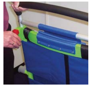
15. Undo the red spring clips on the handle and gently lower, close the red spring clips and lift the handle until it locks into place. Pass support harness through and over the handle.