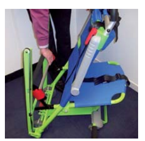
16. Fold the arms back and close the chair from the side by releasing the red locking mechanism on the track, push forward from the top handle and fold the chair together.